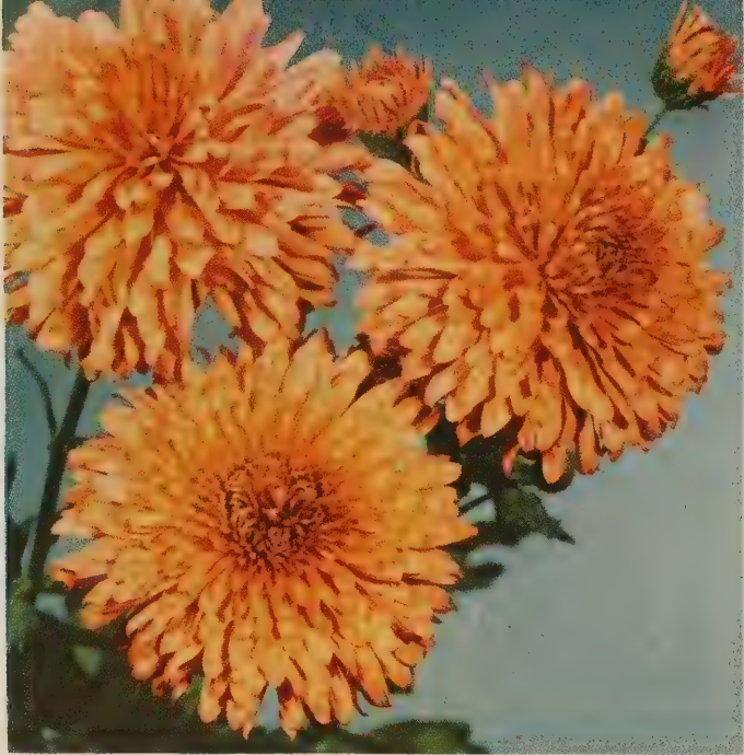
KATHLEEN LEHMAN. 60c each; 3 for $1.50